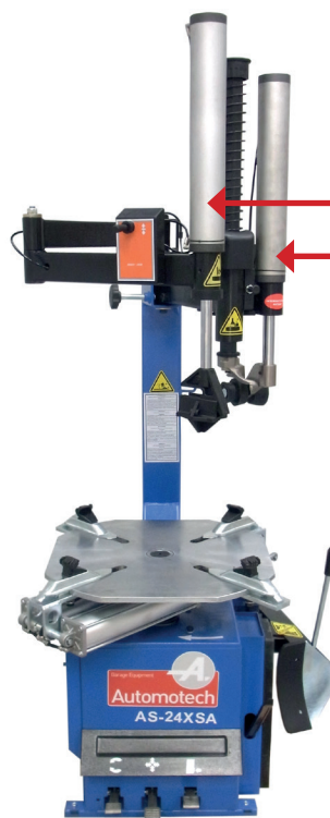
Twin assist arms